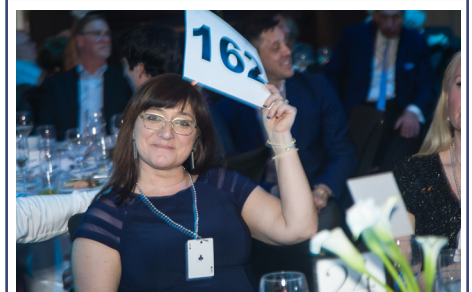
Guests held their bidder cards high.

and one-of-a-kind items. This year's Sponsor a Child benefited Project L.A.N.E., our daily healthy lifestyles program. With the help of two matching gifts, our generous attendees, and committed sponsors, we raised a record-breaking total of $500,331! We are humbled and grateful for every community member who invests in our kids. YOU are helping to pave the way for Great Futures - thank you!